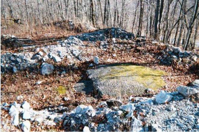
Fig 10: Filled in mine shaft