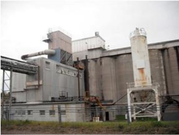
Fig 2: Gouverneur Talc mine buildings

Rumors had been circulating as early as 1968 that International Talc Company would be selling to another company, but miners had remained largely uninformed of the dealings or possible consequences. Then, in May of 1974, miners were terminated