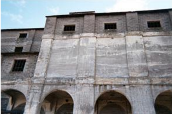
Fig 8: Inscription reads “Mill No.3, 1917”