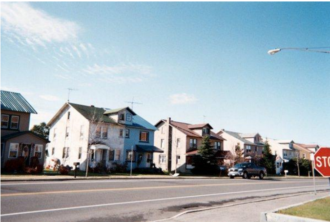
Fig 5: Company houses

The Republic Steel Corporation, which bought out the Chateaugay Iron Ore Company in 1930, continued to control the Lyon Mountain hamlet as a company town