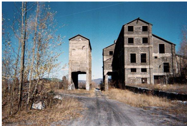
Fig 4: Loading facilities for hopper cars on railroad spur lines

over 500 million tons of ore that was registered at 40% iron. 104 With this discovery, the Company mobilized some three hundred workers to fell timber for charcoal production, and to rebuild the Standish blast furnace so that it could produce 25,000 tons of pig iron each year. 105 The major stockholder in the Chateaugay Iron and Ore Company at this time was the Delaware & Hudson Railroad Company, 106 which took over business of the former Lake Champlain Railroad in 1903. 107 In 1914, the main shaft at Lyon Mountain was drilled deep underground in order to replace the original open-pit mines. 108 As iron-ore production increased, the charcoal supply for the Standish furnace dwindled because of local deforestation. Charcoal is made from wood heated in the absence of oxygen. To switch to an alternative fuel source, the Standish forge was remade into a coke furnace. Coke, a distilled product of coal, represented a more long term fuel solution. With the advent of the World Wars in 1914 and 1939, the Lyon Mountain mines were pushed towards their maximum production. 109 During World War II, three shifts ran round the clock to ensure continuous production of ore. Over 700 men worked each shift. 110