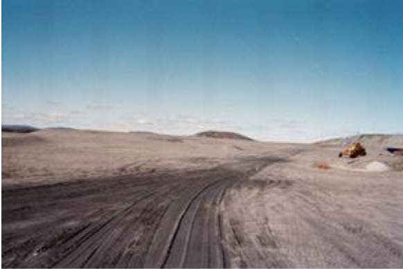
Fig 7: Mine Tailings

The hamlet of Lyon Mountain was once described as the "town that will never die," but the end of mining in 1966 proved to be the first in a string of economic hardships on the town. Most of the old mine buildings at Lyon Mountain have now been