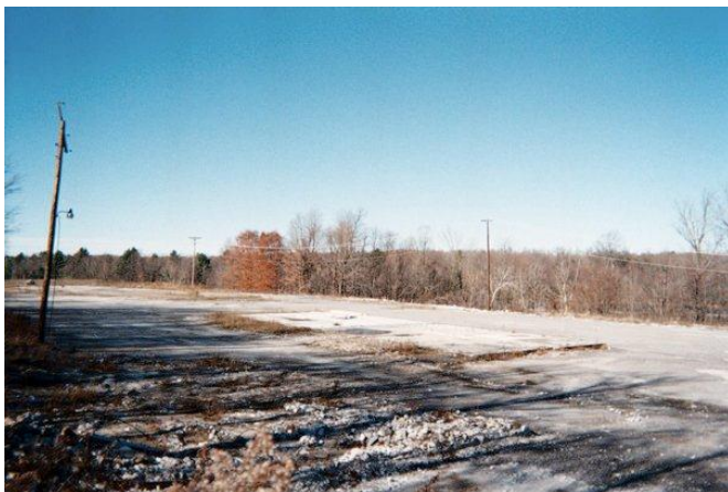
Fig 9: Abandoned site of old company buildings

The Final Environmental Impact Statement submitted by the St. Joe Zinc Company was a revision of the draft. It included the transcripts that had been recorded at the public hearing and the company’s response to statements made at the public hearing. The Final EIS addressed areas of major environmental concern, including but not limited to, the mine’s effect on water quality and runoff into the nearby Van Rensselaer Creek, the mine’s effect on the Village of Canton’s upland water supply, the possible threat of asbestos minerals and radiation at the site, the degradation of roads from heavy trucking when moving ore from the Pierrepont mine to an existing mill at Balmat, and the impact of noise and its effect on quality of life.