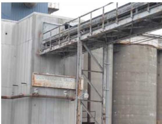
Fig 3: Sign reads “Gouverneur Talc Subsidiary of R.T Vanderbilt Co.”

Although the International Talc Company’s motivations for selling their assets to Gouverneur Talc Company have remained elusive, there is reason to believe that they were troubled by “increasing environmental concern over asbestos and its connection to the talc industry” and the financial commitment the company would have to